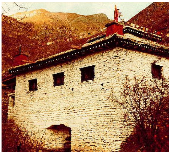
The "Temple Of Miraculous Fire" at Muktinath, Nepal. Photo by Ken Street (Nov. 1979).

[For more on this subject, please read our tract The Temple Of Miraculous Fire .]